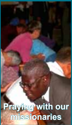
Praying with our missionaries