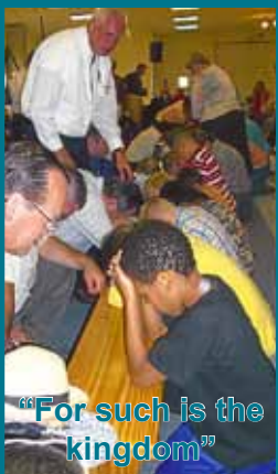
"For such is the kingdom"