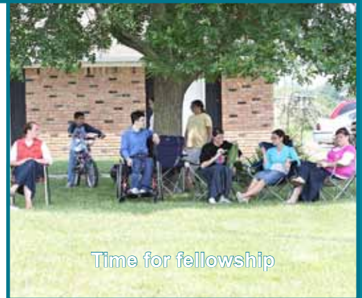
Time for fellowship