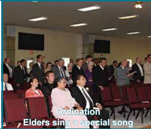
Ordination Elders sing a special song