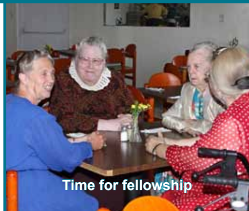
Time for fellowship