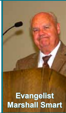
Evangelist Marshall Smart