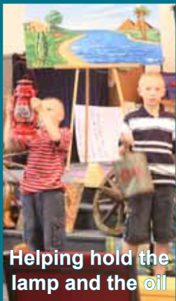
Helping hold the lamp and the oil