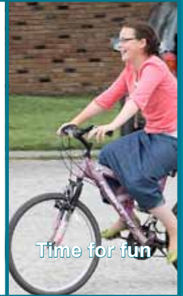
Time for fun