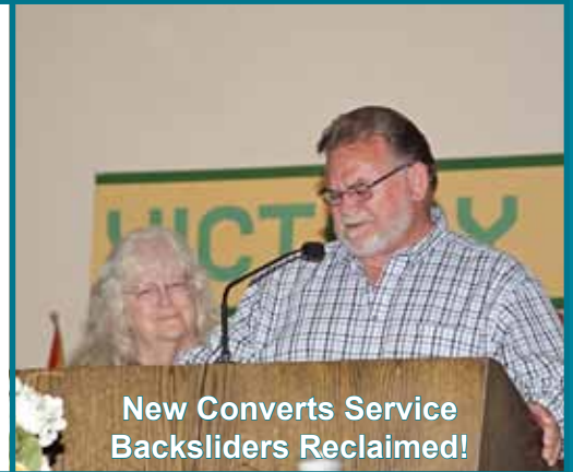
New Converts Service Backsliders Reclaimed!