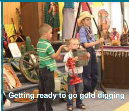
Getting ready to go gold digging