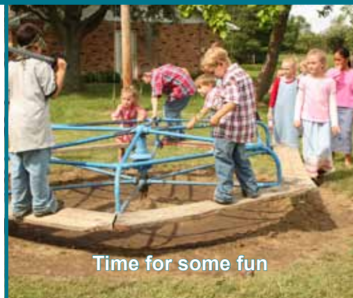
Time for some fun