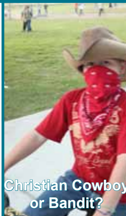
Christian Cowboy or Bandit?