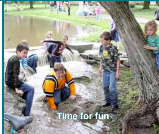
Time for fun