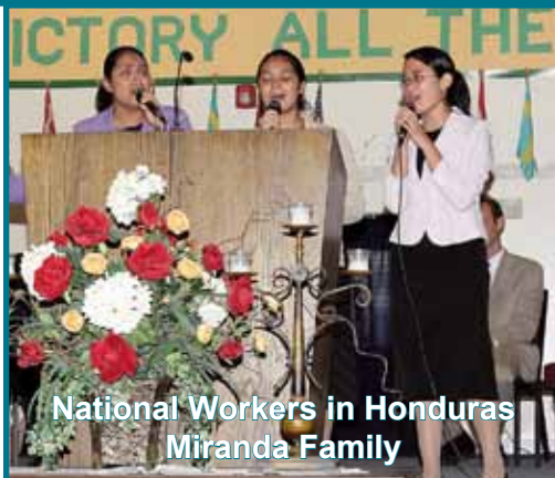
National Workers in Honduras Miranda Family