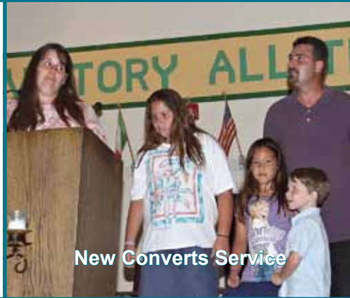
New Converts Service