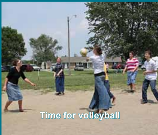
Time for volleyball