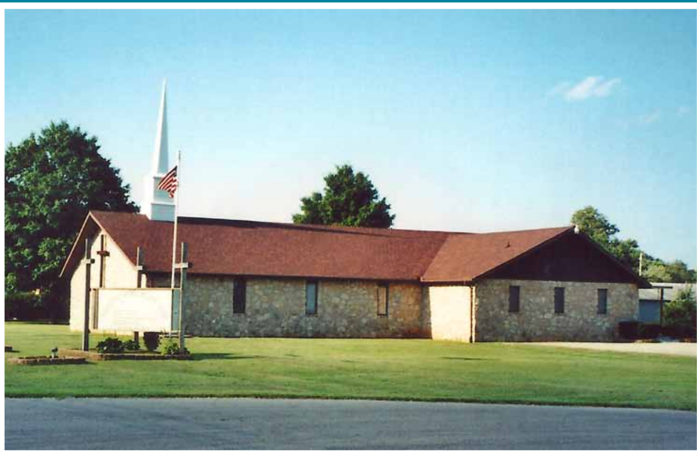
Bethel Holiness Church—Knightstown, Indiana