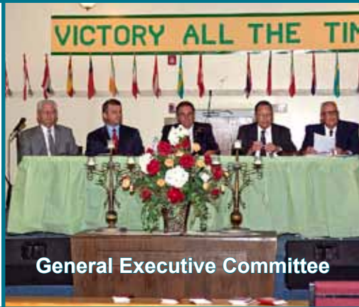
General Executive Committee